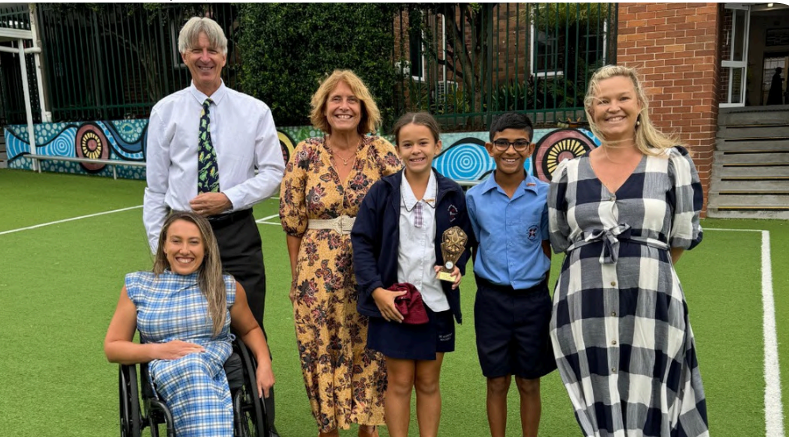
CEF team at St Andrew's Catholic Primary School, Malabar

We also thank all other school communities for showing support of the fundraising initiative and can't wait to hear all about this year's event!